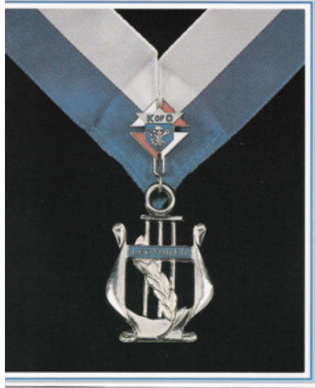
Lecturer – Lyre and Scroll. These are traditionally symbolic of music and literature and the arts. Hence the lecturer is in charge of entertainment.