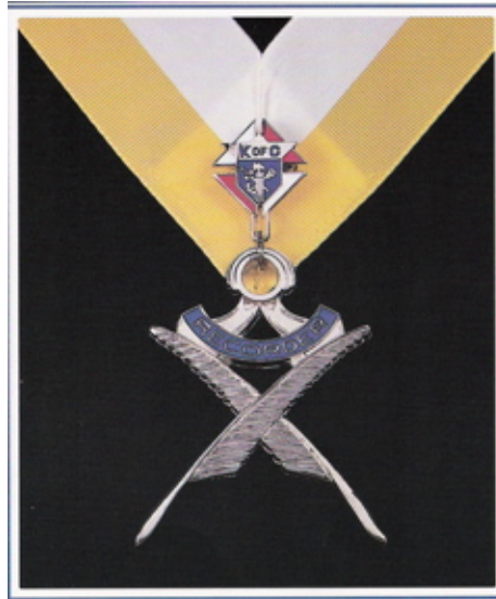
The Recorder – Crossed quills. Symbolic of his responsibilities for letter and document (records) writing and preservation.