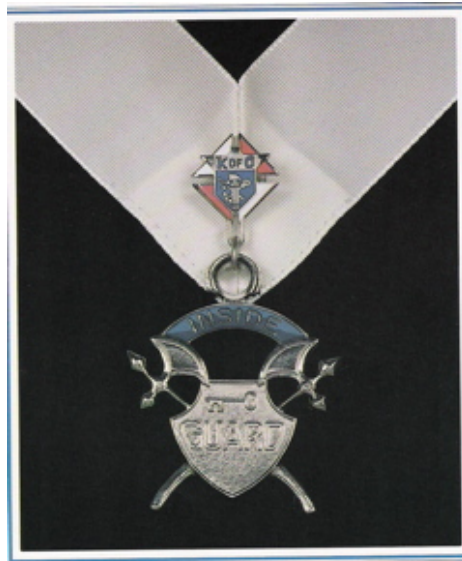
The Inside Guard - Crossed Axes and Key. Key is symbolic of a guardian, secrecy and responsibility for safekeeping and admission. Axe is indicative of authority even to the point of punishment to maintain it. Originally, the axe was symbolic of power over life and death.