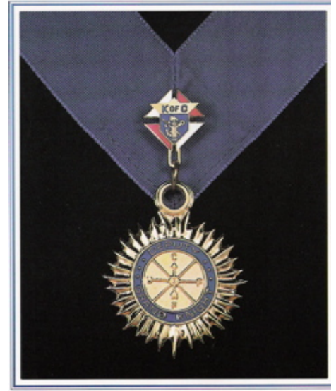
The Deputy Grand Knight – The Compass. Also used by Columbus, the Mariner. (The Knights Of Columbus Compass is known as the Compass of Virtue, its 32 flame-like rays representing the 32 virtues which may be possessed by men.)