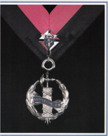
The Warden - An axe bound with rods known as faces, traditionally carried by the guards or protectors of Roman magistrates as a symbol of authority. The warden, ideally, has and exercises that authority.