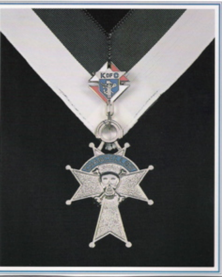
The Chancellor – The Isabella Cross, with Skull and Crossbones. The cross is self explanatory while the skull and crossbones are symbolic of man's mortality.