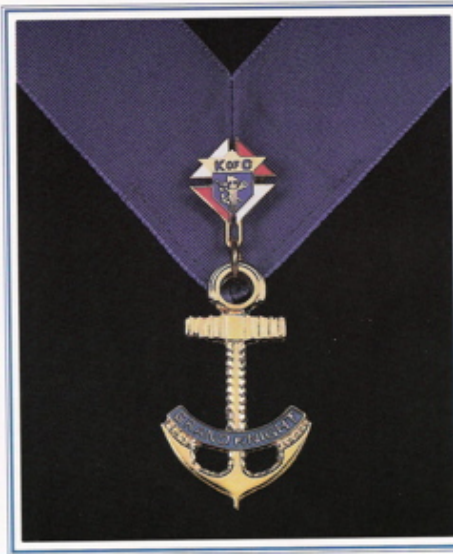
The Grand Knight – The Anchor; indicative of Columbus, the Mariner: The Anchor has also been a variant form of the Cross for Centuries.