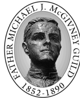
Fr. McGivney Guild