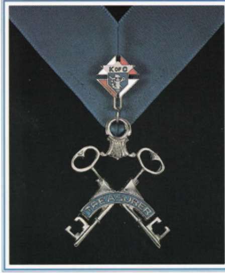
The Treasurer – Crossed Keys. Symbolic of his complete authority over funds (money), particularly responsible for its safekeeping.