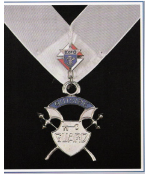
The Outside Guard - Crossed Axes and Key. Key is symbolic of a guardian, secrecy and responsibility for safekeeping and admission. Axe is indicative of authority even to the point of punishment to maintain it. Originally, the axe was symbolic of power over life and death.