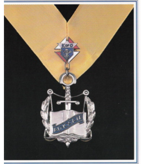
The Advocate – The Scroll (legal literature and law) with sword (the power to defend and enforce the law).