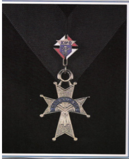
Chaplain – Isabella Cross in silver and blue. Self-explanatory.