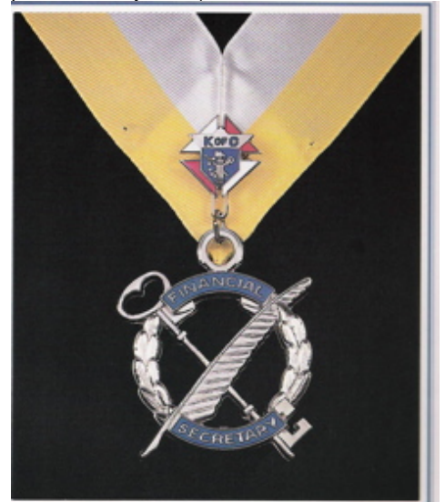
The Financial Secretary – Crossed key and quill. The key as always been associated with an officer concerned with money, safe-keeping and secrecy. The quill is the symbol of a "scribe" – a record keeper – one who writes letters, documents, etc.